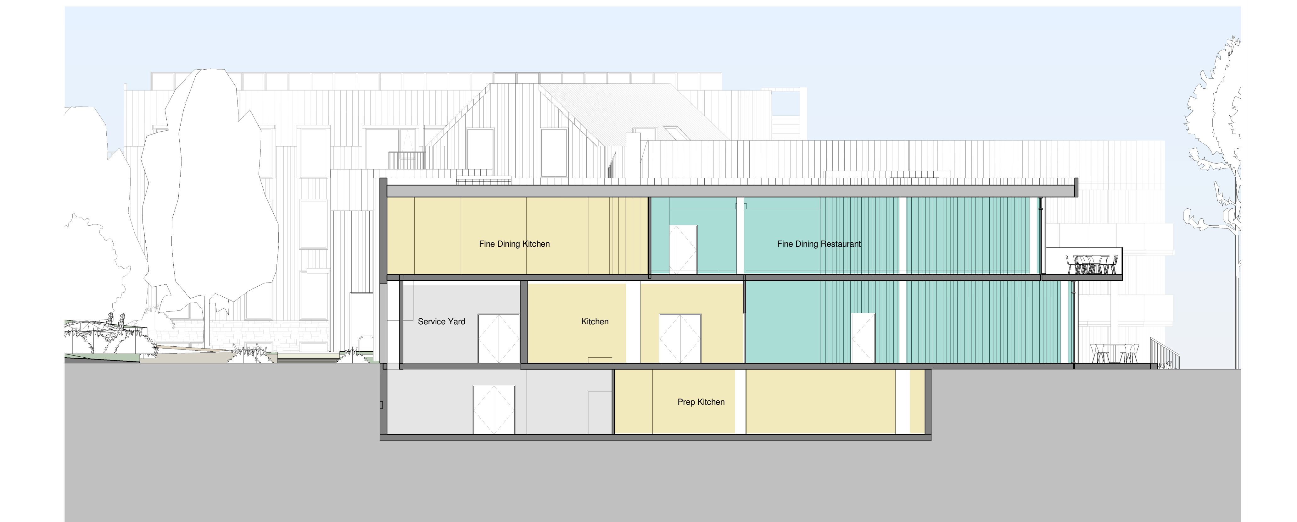
Section CC 1:100