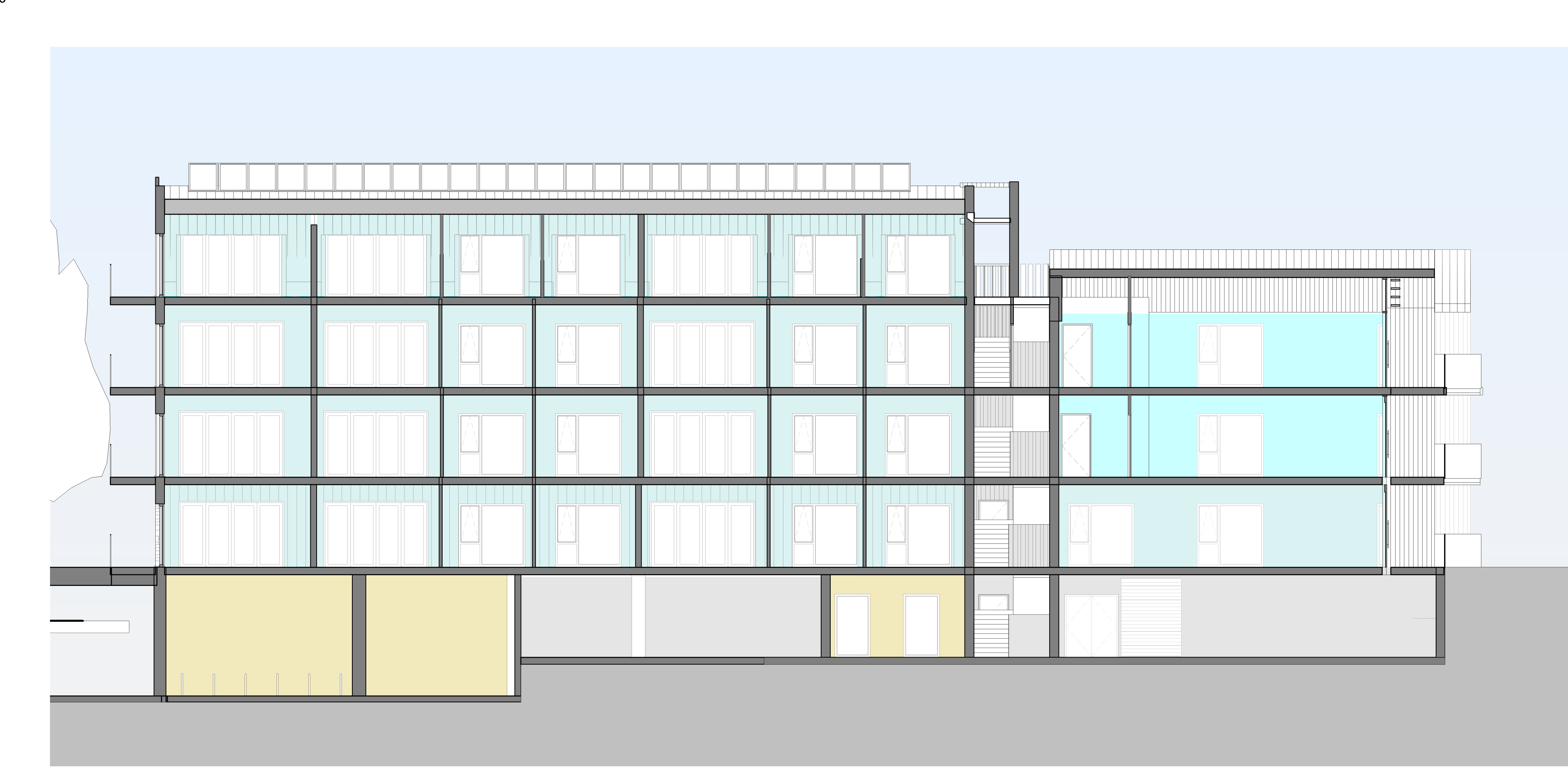
Section BB 1:100